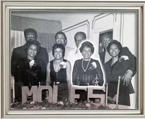
Induction – 1976 Mole Magnolia & Mule Charles